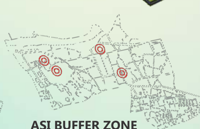
ASI BUFFER ZONE